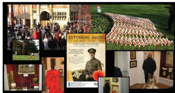
Some of 2014's commemoration of the Great War