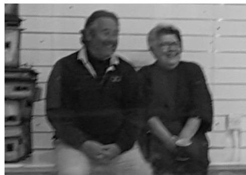
(the Chair and Secretary share a moment at ARTworks)

My thanks to everyone who volunteers and who supports the work we do.